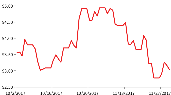
Figure 3: US Dollar erases October gains

Continuing economic and political uncertainties in the UK weighed on equities and can explain much of the 1.8% decline. Economic data was mixed with the all-sector Purchasing Managers' Index at the highest level in six months, yet in contrast retail sales growth weakened. In light of political uncertainties, Brexit complications and a poor outlook for labour productivity, the Office for Budget responsibility revised down GDP growth forecasts. Growth in 2017 is now forecasted at 1.5%, down from a 2.0% forecast made in March. Growth is expected to continue to slow, with 1.4% and 1.3% forecasted for 2018 and 2019 respectively. UK inflation held steady at a five year high of 3.0%, keeping pressure on real wage growth which is forecast to remain negative in October.