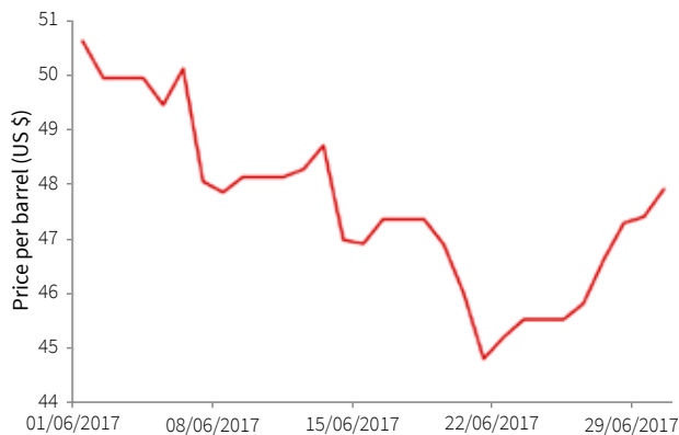
Figure 1: Brent crude price

The weakness in US Dollar during May continued into June and on a trade weighted basis the US Dollar has fallen over 7% since its peak in late 2016, taking it back to early 2015 trading ranges. The US Dollar fell particularly sharply in the last week of June. Conversely, the Euro rose 1.6% versus the US Dollar in June, ending the quarter up 7.3% following a combination of rising growth, improving economic forecasts and a more favourable political backdrop.