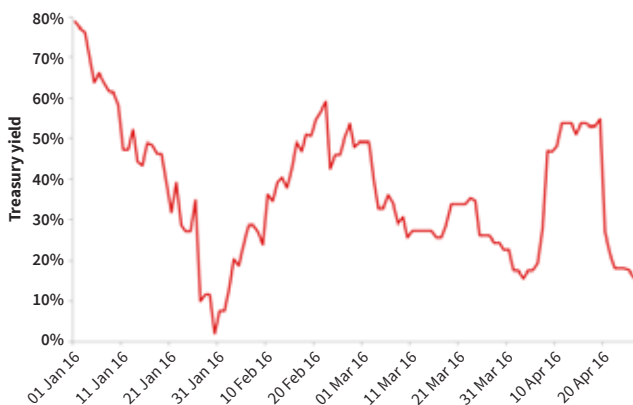
Figure 2. Expected probability of a Fed hike in July, over the year to date.

Although the Fed had indicated in December last year that they were targeting four incremental rate rises this year, weak global conditions in the early weeks of the year caused plans to be put on hold. However, continued improvement in the labour market and some evidence of a pick-up in wages, together with increased stability in financial markets, produced a marked change in the Fed's rhetoric. The mid-month release of the April Open Market Committee (FOMC) meeting minutes showed that the Fed were still contemplating a summer hike, and with the inflation rate hovering at 1.6% using the Fed's preferred measure, Fed governors indicated that a rate rise in either June or July was likely.