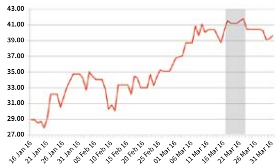
Figure 3. Oil price over Q1

is likely to be at or close to an end. There are therefore improving prospects that the bottom of the market has been reached, and a modest recovery underway, towards the USD 50 level that many forecasters see as the new equilibrium price.