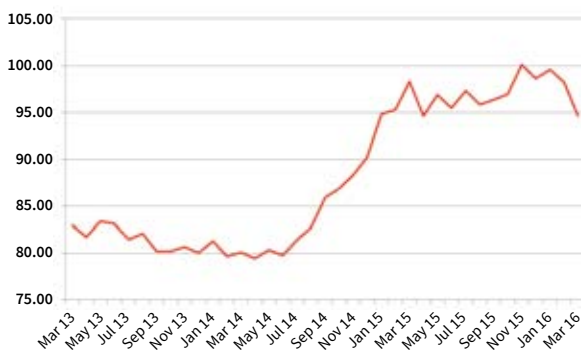
Figure 2. USD over 3 years

Notably the rally in emerging market equities started on the same day that the oil price bottomed; risk assets have in the short-term become highly sensitive to movements in the oil price. Despite record high crude inventories, evidence of significant falls in US oil production together with rising demand for oil provided support for the price, but arguably the most important factor was discussions among OPEC, and certain non OPEC members, of a production freeze at current levels. The April 17th meeting to discuss this is becoming a key focal point for markets. Whatever the outcome of this meeting, the prospect of a better balance between supply and demand is drawing closer, and by early 2017 the current oversupply in the oil market